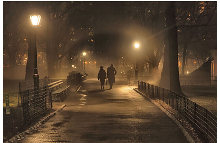
With image enhancement

Image processing is based on the Retinex theory, where pixels are optimised individually.