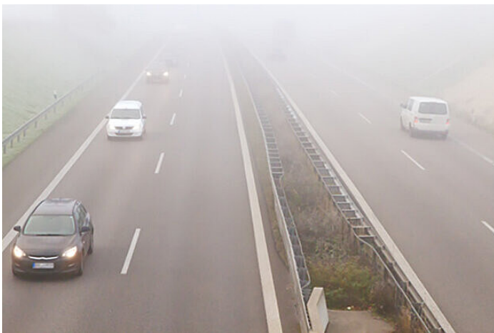
Areas of the image that appear blurred