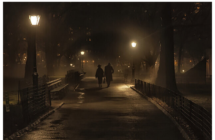
Without image enhancement